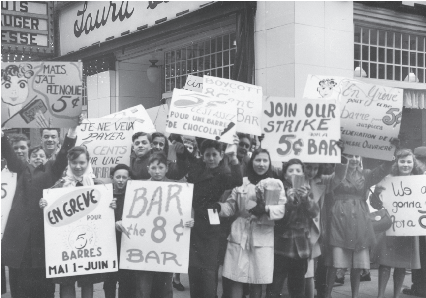
Figure 1. Young activists in Montréal, some of them the children of Labor-Progressive Party and United Jewish People's Order members, protest a three-cent nationwide rise in the price of chocolate bars, on May Day 1947. Bilingual placards suggest that the campaign aimed to reach anglophones and francophones and may indicate that some protesters were among the latter group, although the Communist Party had few francophone members. "Candy Bar Boycott, Montreal, May 1947."

Canadian Tribune , Price Campaign, Montréal, PA-093691, acc. no. 1974-264 NPC, box 03453, Library and Archives Canada.