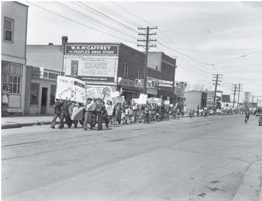
Figure 3. View of Lethbridge youth in a “candy bar parade” along 13 Street North. The sign in front reads, “Down with 8¢ bars.”